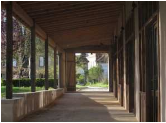
The alley leading to studios